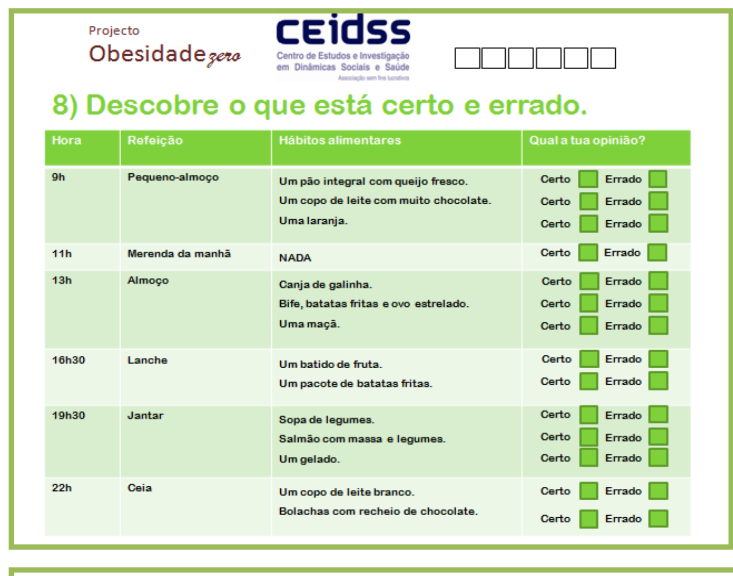
Figure 1 – "Zero" Obesity Questionnaire (example of some items)

Pearson correlation coefficients were computed between test and retest scores for the individual items and for the total score.